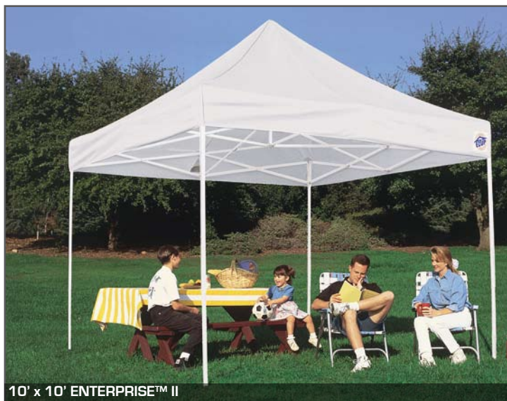
10' x 10' ENTERPRISE™ II

The Enterprise™ II Instant Shelter® units are the ideal commercial grade canopy for outdoor vendors, parties and personal use.