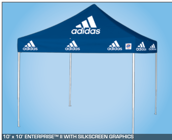
10' x 10' ENTERPRISE™ II WITH SILKSCREEN GRAPHICS